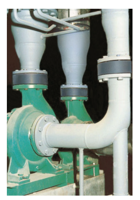
STENFLEX® type GRV at pumps in a heating system

☐ Suitability approval for warm water and heating systems