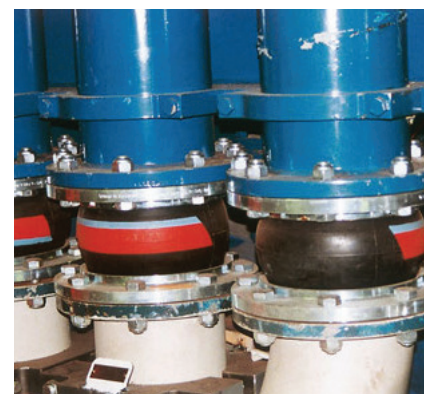
STENFLEX® type AS-1 used in cooling water system of ship's engine